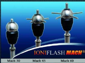
Mach 30 Mach 45 Mach 60

SOLUTION - The IONIFLASH Research efforts at France Paratonnerres have led to the development of the E.S.E. (Early Streamer Transition) IONIFLASH MACH®, which technology has demonstrated its performance of activation and protection, even after numerous lightning occurred on the installation (patented).